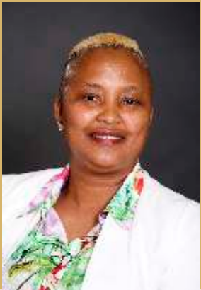
New Chairperson of COGTA Portfolio Committee Honourable Zinhle Cele