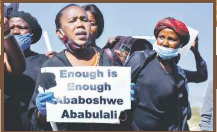
Women protesting the killings in the Mthwalume area

T he Community Safety and Liaison Portfolio Committee, together with the Quality of Life Standing Committee in the Legislature will held a stakeholders' engagement following the brutal killings of women in Mthwalume. Amongst the key stakeholders was the Mayor of Umzumbe Municipality, Ward Councillors, Traditional Leadership of the area, SAPS Management, CPFs and Department of Social Development.