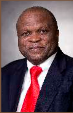
Honourable Themba Mthembu Deputy Speaker