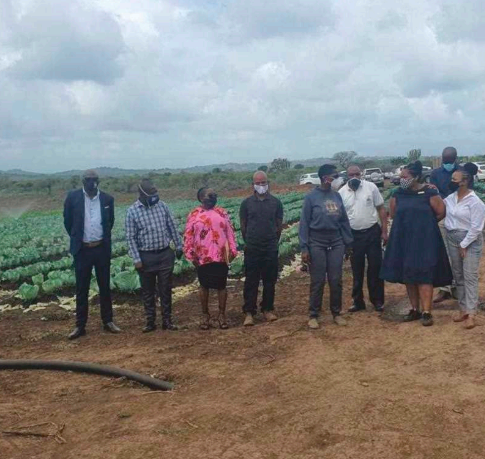
Members of the Premier Portfolio Committee visiting a farm that is youth owned and managed.

Chairperson Honourable Celiwe Madlopha told local media that the legislature will keep an eye on the implementation of the projects to ensure that there are no incidents of corruption.