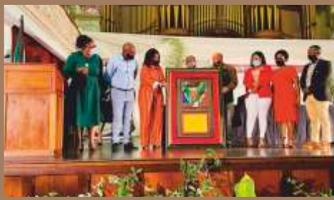
Honourable Speaker Nontembeko Boyce, Deputy Speaker Honourable Themba Mthembu and Premier Mr Sihle Zikalala handing over a token of appreciation to Speaker and former Premier Honourable Willies Mchunu after delivering the Harry Gwala Memorial Lecture.

In preserving the legacy and the heritage of the KwaZulu-Natal Legislature, the institution held a series of events on December 15 last year including unveiling the plaque of all Members who served in the legislature from 1994 to this current sixth legislature.