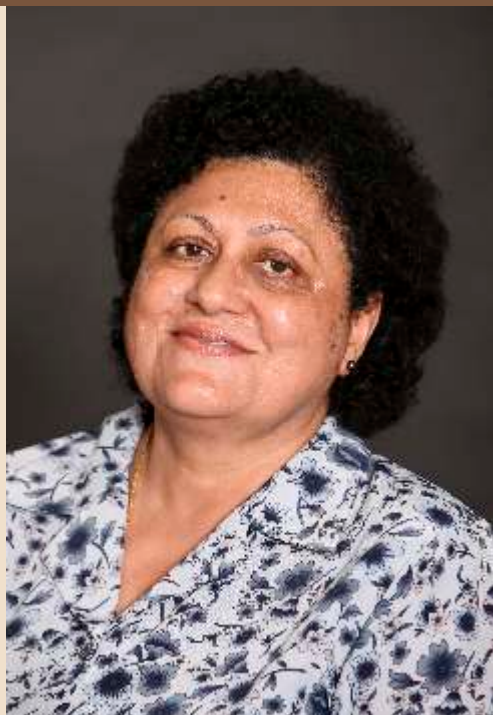
Chairperson of the Ad-Hoc Committee on Investigations Honourable Maggie Govender.

K waZulu-Natal legislature has established an ad hoc committee to conduct oversight over investigations conducted in provincial departments and public entities.