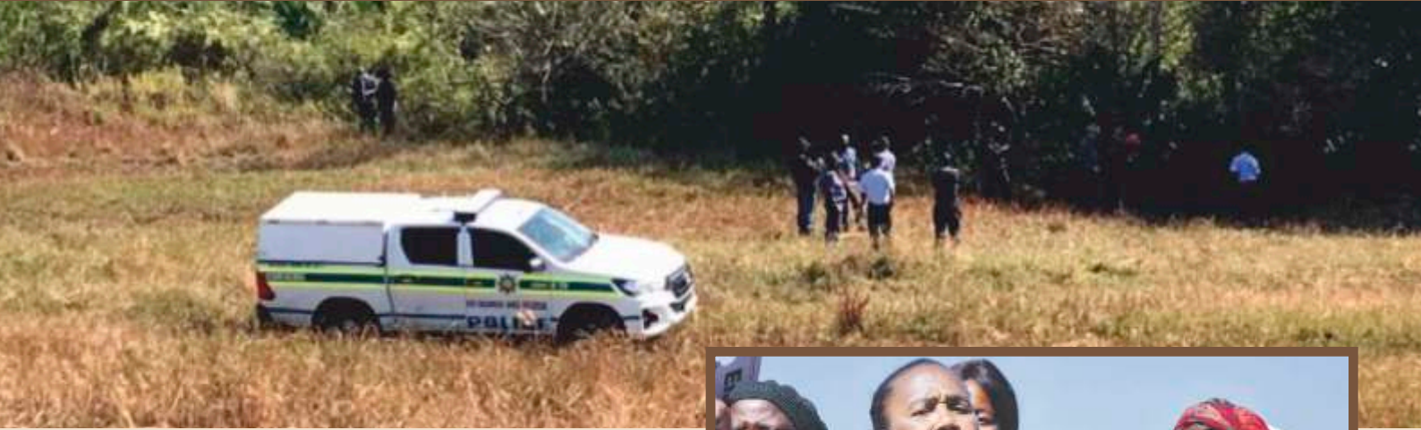
Police van searching for more bodies.