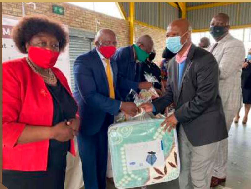
Chief Whip of the Provincial Legislature Honourable Bangokwakhe Zuma making a contribution on behalf of the Legislaure to Senior Citizens who attended the Senior Citizens Parliament in Uthukela District.

The day ended with an address by the Speaker of the Legislature Hon. Nontembeko Boyce who promised that all resolutions that were adopted by the Senior Citizens will be followed upon by relevant portfolio committees of the Legislature to ensure swift implementation of those resolutions by provincial departments. She also appealed to the MEC for Community Safety to ensure maximum availability and visibility of SAPS at pension pay-points to guarantee the safety of the elders and that the crimes pertaining to elderly abuse, GBV be given a priority and should be dealt with as a matter of national crisis.