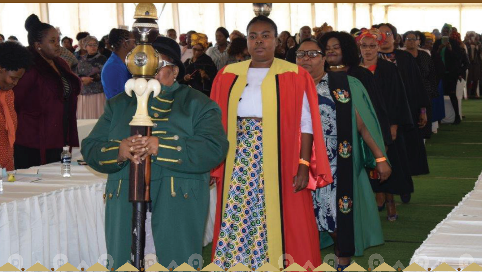
Women Sector Parliament