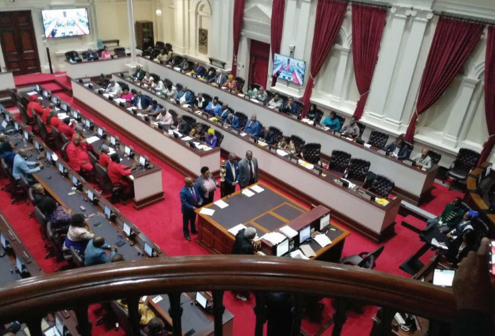
Swearing-In of Members of the Provincial Legislature