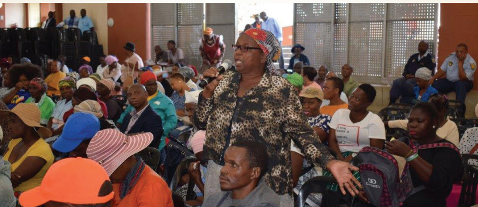
Member of the public making inputs during public engagements

Honourable Chairperson, we have not reneged on our commitment to revive the Provincial Speakers' Forum. Our consultation process with strategic stakeholders such as SALGA and Cogta should see us get started during the course of the year. We need to do this as our contribution to assist oversight and law-making at local government levels.