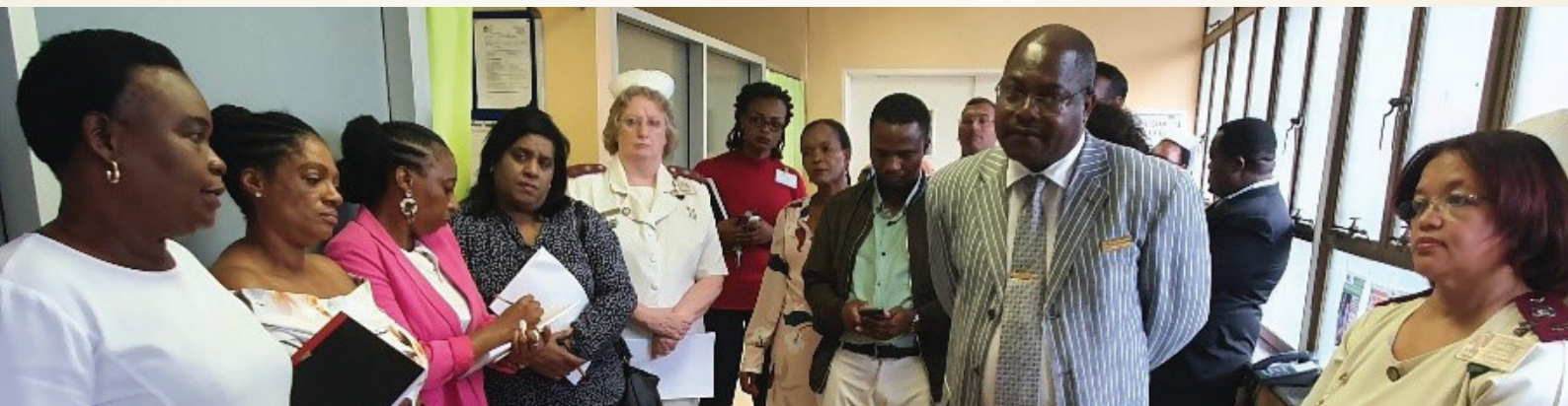
MPLs visit Northdale Hospital

We have, Honourable Chairperson, amended and approved the policy as promised. However, while we had also approved an implementation plan, Committees have not been able to embark on the programme in light of Covid-19 lockdowns. This will is anticipated to be the status until the country has lifted the travel ban and the host countries have given the go ahead in respect of receiving travellers from other countries.