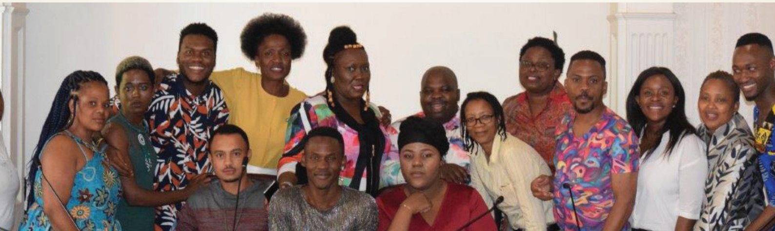
Speaker's Social Responsibility Programme engages Gender and LGBTQI+ leadership