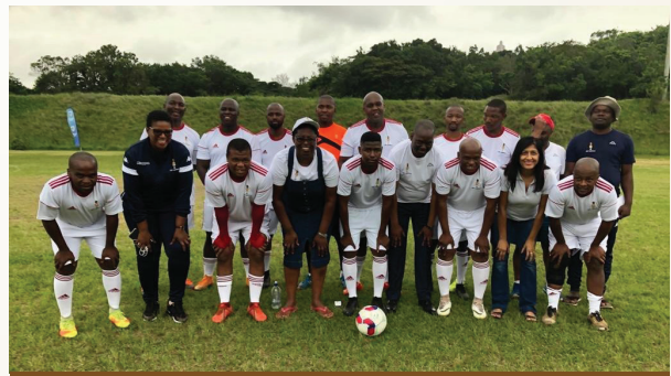
KZN Legislature Soccer Team at the 2019 Inter-Legislature Games

The Legislature hosted the National Inter-Legislature Sector Games from the 28 th to the 30 th November in 2019 in Durban. We see the Inter-Legislature Games as a platform for promoting healthy lifestyle for our Members and Staff within the sector. I am happy to say that KwaZulu-Natal Legislature performed exceptionally well during these games. We bagged most of the trophies and yes, we came out tops. Our heartfelt gratitude goes to our Organising team, management and political leadership for effectively coordinating and delivering the games. We, in a special way want to recognise that great dedication was demonstrated on the field by our teams in all sporting codes that we took part in.