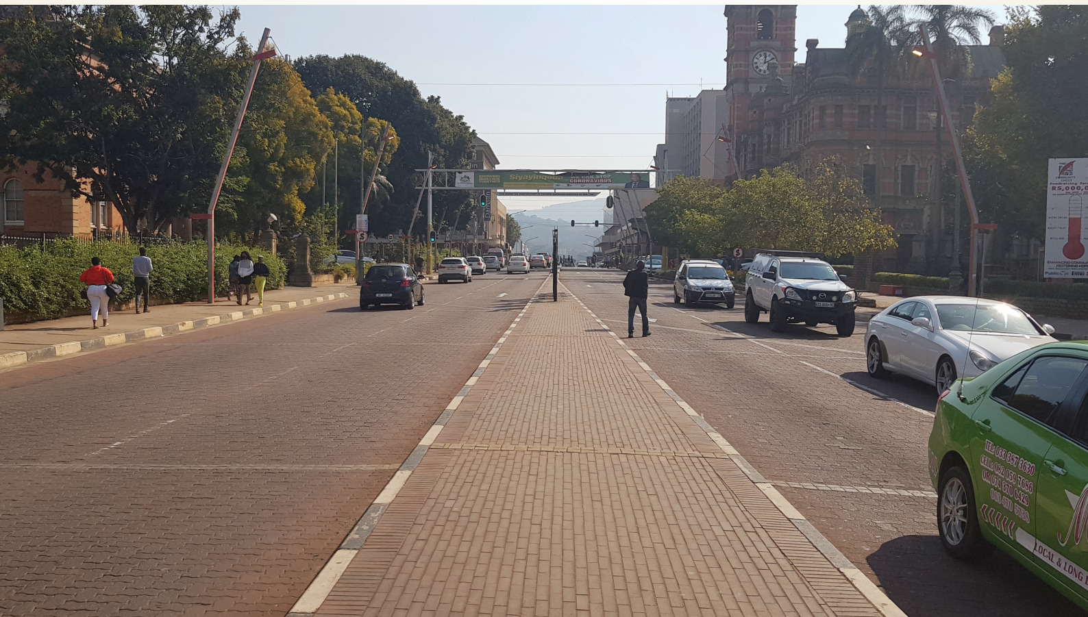
June 5 2020 at 12:00 • A Cleaner Pietermaritzburg City Centre During Lockdown Level 3

Honourable Chairperson, it should suffice to state that the list is not exhaustive, we are merely giving a few pointers in the direction of areas we are to embrace going forward.