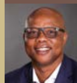
HON. BM ZUMA Chief Whip