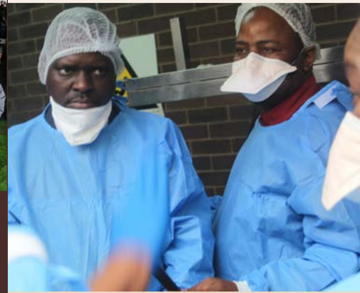
Members of the KZN Legislature visiting health institutions as part of their oversight work with the Deputy Speaker (far left).