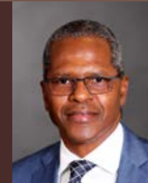
HON. VF HLABISA Leader Of The Official Opposition