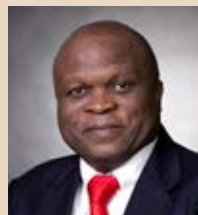
HON. RT MTHEMBU Chairperson of Committees

The 16 Days of Activism for No Violence against Women and Children Campaign is a United Nations campaign that takes place annually from 25 November (International Day of No Violence against Women) to 10 December (International Human Rights Day). Other key annual commemorative days during this period include World Aids Day on 1 December and the International Day for Persons with Disabilities on 3 December.