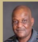
HON. MB NTULI Transport, Community Safety and Liaison