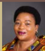
HON. N DUBE-NCUBE Economic Development, Tourism and Environmental Affairs