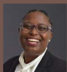
HON. NN BOYCE Speaker