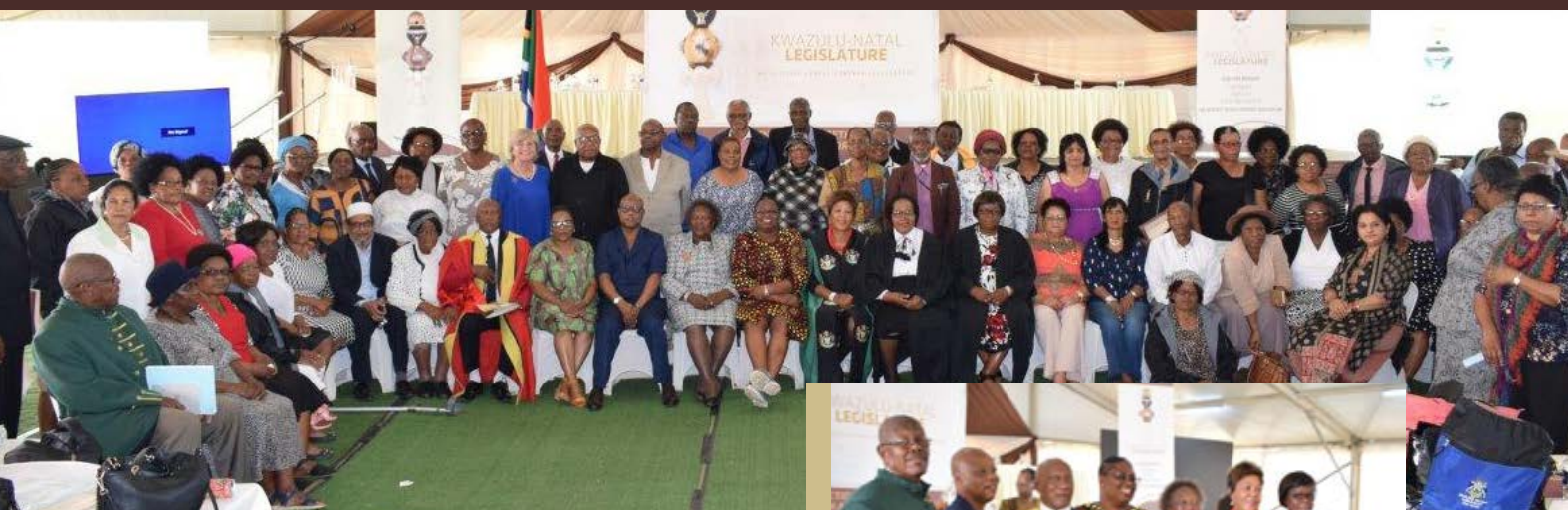
KZN Legislature Members and delegates to the Senior Citizens' Parliament.

The KwaZulu-Natal Legislature held its annual Senior Citizens' Parliament in October last year at the Thembeni Sports Field in KwaDukuza Municipality.