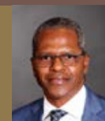
HON. VF HLABISA Leader Of The Official Opposition