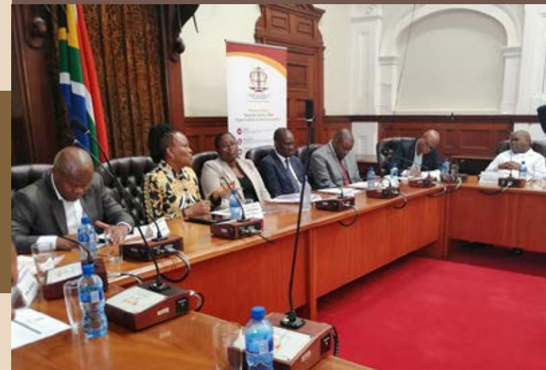
The Public Protector Advocate Busisiwe Mkhwebane paying a courtesy visit to the KZN Legislature to meet the Speaker and members of the strategic leadership.