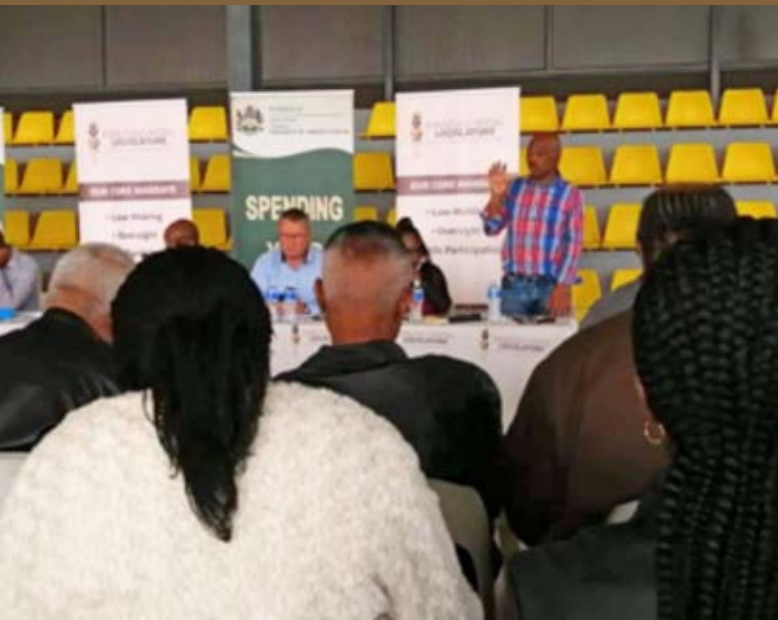
The Chairperson Honourable 'K.K.' Nkosi welcoming the members of the community to the Stakeholder Engagement Session.