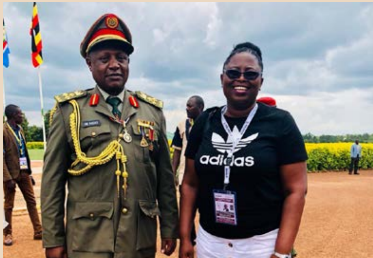
Speaker Honourable Boyce with the member of the Ugandan Defense Force.