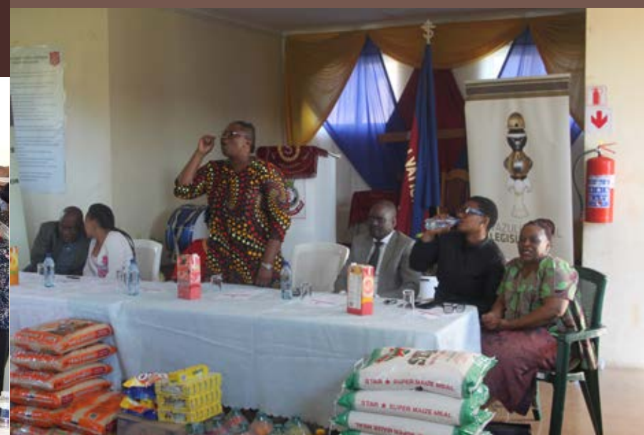
KZN Legislature Speaker Honourable Nontembeko Boyce addressing Members and senior citizens during the Speaker's Social Responsibility Programme in KwaDukuza. Right: Planting vegetables for the senior citizens, and gardening with Honourable Phumzile Mbatha-Cele and Deputy Speaker Honourable Ndobe.

Following the sitting of the Senior Citizens' Parliament the following day, resolutions were adopted and relevant committees of the KZN Legislature undertook to monitor the implementation of these resolutions.