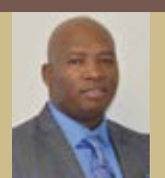
HON. TS MTSHALI ANC Whip