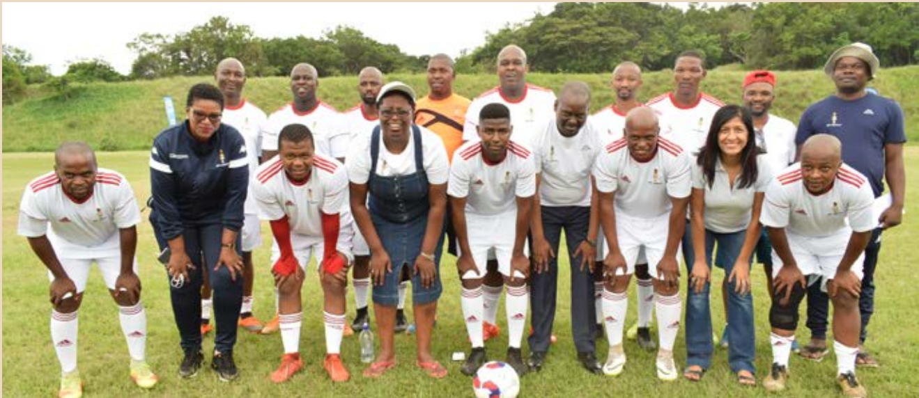
Top: Members of KZN Legislature's soccer team, were supported by the Speaker, Deputy Speaker, Deputy Chief Whip and the Secretary to the Legislature. Below: The Institution's Netball team also performed very well.

Teams from KwaZulu-Natal Legislature walked away with more trophies than any other team that participated in the Inter-Legislature games, which took place in eThekwinI at the end of last year.