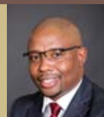
HON. KI MSHENGU Education