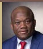
HON. S ZIKALALA Premier