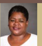
HON. B NTSHANGASE ANC Whip