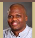
HON. ZM MNCWANGO Leader Of The Party