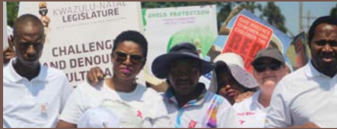
Left: Deputy Chief Whip Honourable Vuyiswa Caluza (second from right) represented KZN Legislature in a march to protest against gender-based violence as part of 16 Days of Activism for No Violence against Women and Children.

The KwaZulu-Natal Legislature participated in a number of activities, including a march against gender-based violence, as part of the 16 Days of Activism for No Violence Against Women and Children Campaign.