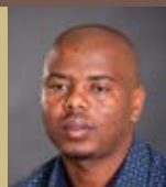
HON. SE HLOMUKA COGTA