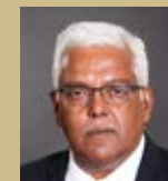
HON. RR PILLAY Finance